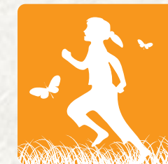
PEOPLE & NATURE