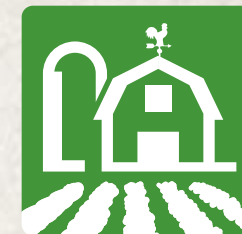
LOCAL FARMS & FOOD